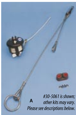
A #30-5061 is shown; other kits may vary. Please see descriptions below.